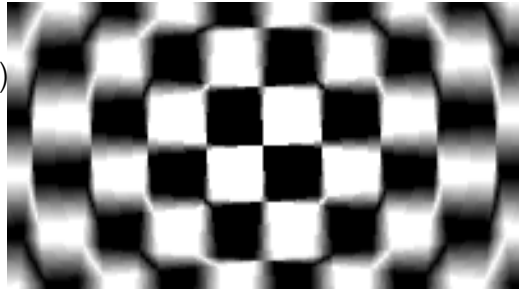
Uniform (Blur 11.25)